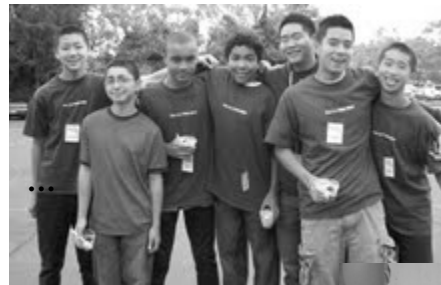
The guys bond during rec. time