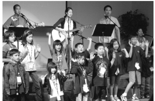
The children lift up their hands in praise as they sing at the retreat.

In closing, I am thankful I had an opportunity to interact and know more about many people in the church, worship God and learn more of His heart for us, and enjoy God's glorious creation.